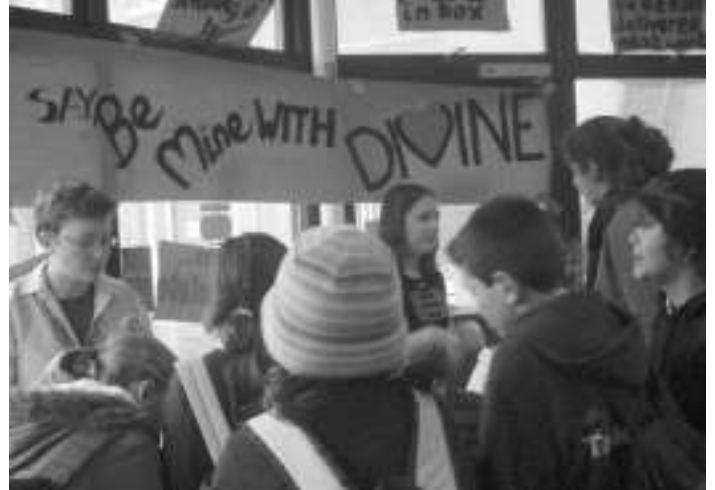
Cotham school P&P raise the profile of Fairtrade.

By doing this you can increase awareness of Fairtrade products and have a great laugh at the same time.