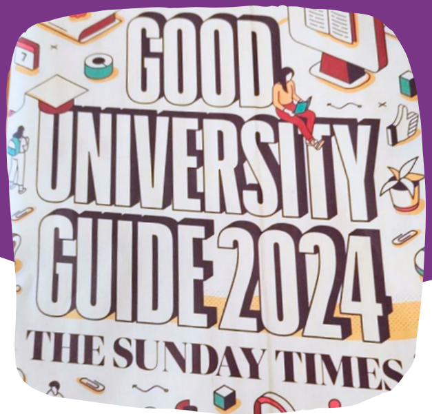
The Sunday Times Good University Guide, including our sustainability ratings (September 2023)

The results of this work has been garnering more and more attention each year. Since 2021, the Guardian has included the University League in its Student Guide, and this year the Sunday Times Good University Guide included a sustainability rating based off our research.