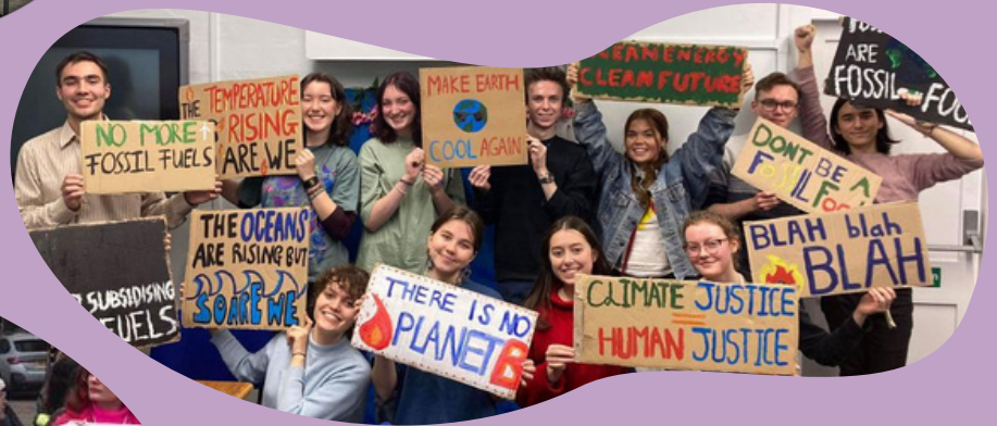
Durham's Eco DU (2023)