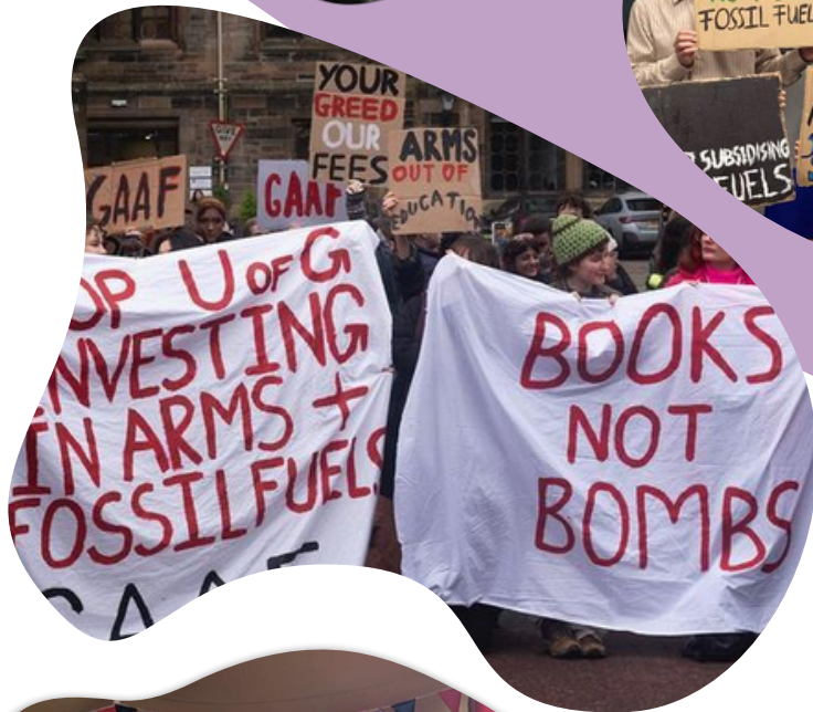
Glasgow Against Arms & Fossil Fuels (GAAF) rally (2023)