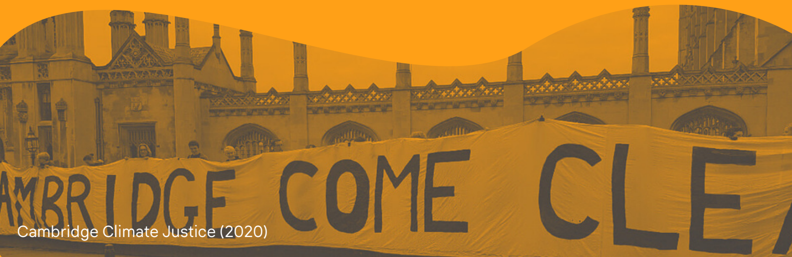
Cambridge Climate Justice (2020)