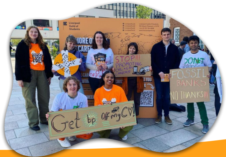
Right: FFC Newcastle (2023) Left: FFC Liverpool (2023)