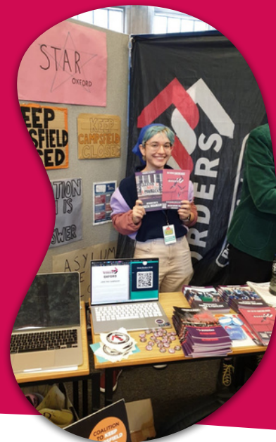
Left: Student Rebellion Leeds protest Thales at their Careers Fair (2023) Above: Divest Borders Nottingham projection for DB day of action (2023) Right: Oxford University Fresher's Fair (2023)