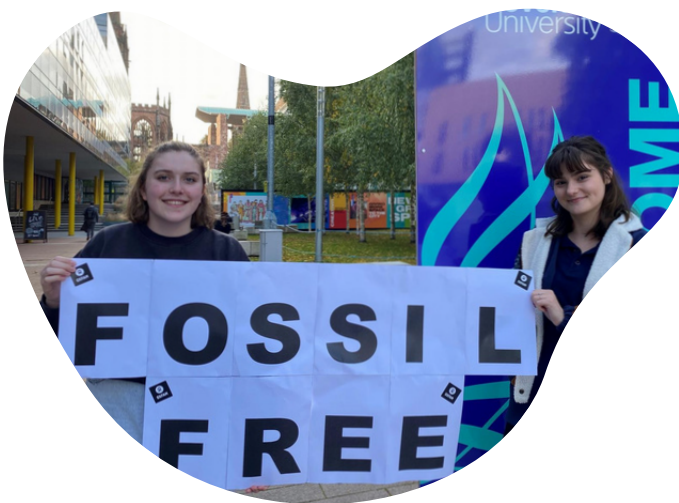
Clockwise from right: FF Liverpool Hope (2023), FF Coventry University (2022), banners from Strathclyde (2023)

We are currently working with 7 groups on these types of campuses, and in December we launched the 2024 Campaign Training Program to further this outreach work.